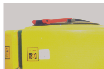
Hinged Vented Cover