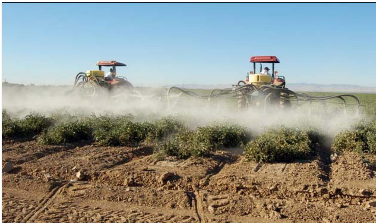
Two 10 nozzle Gearmore Row Crop Dusters applying sulfur in Western Fresno County

Answer: You can see a video of our row crop duster in use by going to http://www.youtube.com/watch?v=ku1Rqx-USoc